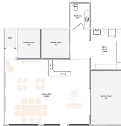
CEREMONY + RECEPTION (10 ppl)

Micro weddings are gaining popularity and for good reason. Opting for a small, unique industrial wedding venue is the perfect way to celebrate your special day. Not only does it offer a modern and trendy atmosphere, but it also provides a romantic setting for couples who want to tie the knot in a more intimate setting. Add ons and preferred vendors available.