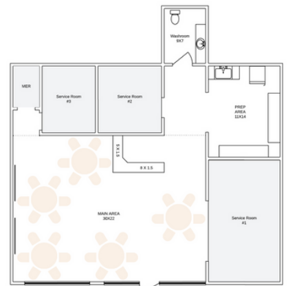
RECEPTION (30 ppl)