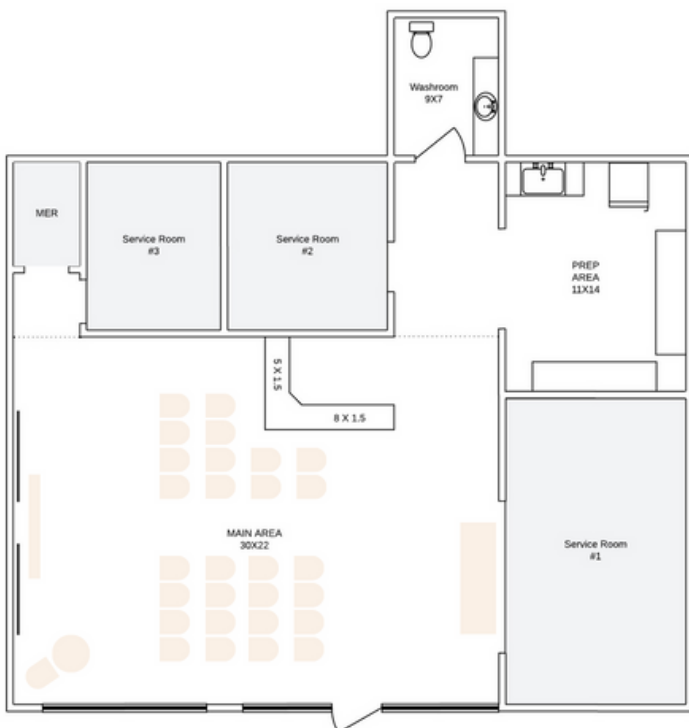
CEREMONY (30 ppl)